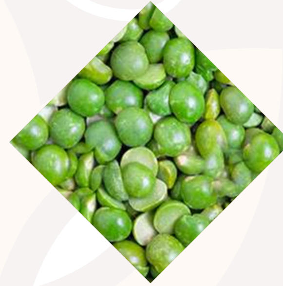
Green Split Peas