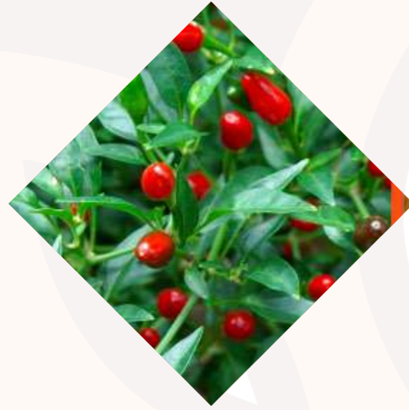
Bird Eye Chilies