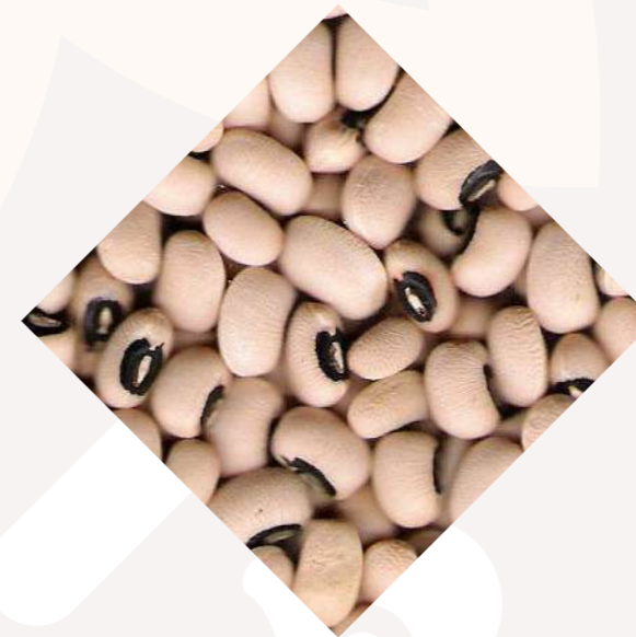
Black Eye Bean