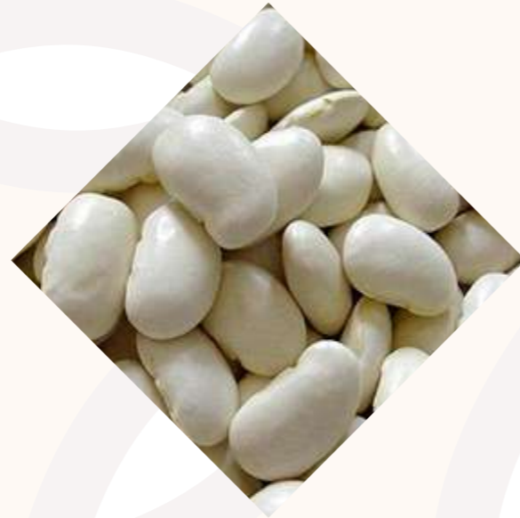
White Kidney Beans