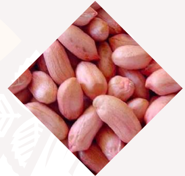
Ground Net Kernels