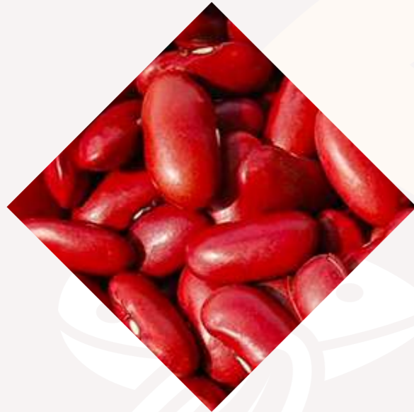
Red Kidney Beans